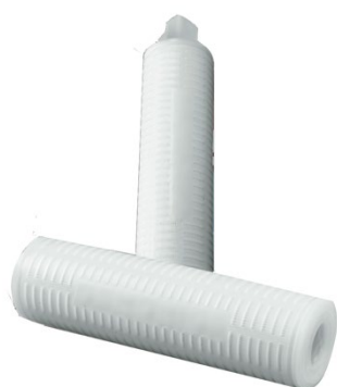
Figure 1: Memtrex NY filters