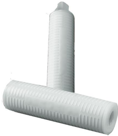
Figure 1: Flotrex AP Filters