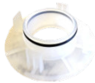
HF 338 end cap

The Strainrite Companies is proud to add the MAXX-Pro to our family of large pleat geometry products. The MAXX-Pro filters are high efficiency, outside to inside flow direction liquid filtration cartridges designed for applications with high contaminant removal requirements. These filters are a direct replacement for the 3M 740™ series and others.