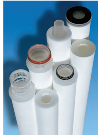
MC Series melt blown cartridge filters feature a molded core that prevents collapse even if subjected to higher temperatures

MC Series cartridges are made entirely of FDA 21CFR 177.1520 compliant polypropylene which provides exceptional chemical compatibility to handle a wide range of process fluids. MC Series cartridges offer economical filtration with flow rates of up to 5 gpm per 10" length and a maximum operating temperature of 125° F. MC Series cartridges are designed for knife-edge seal housings without the use of gaskets or seals. A wide variety of end cap options are also available.