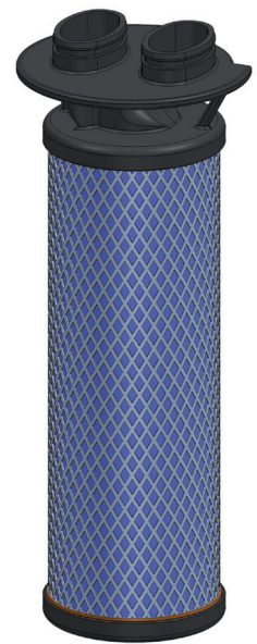
Depth filter V