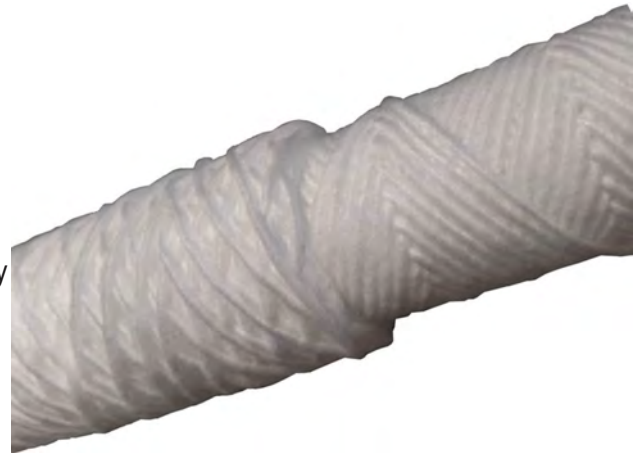
HC Series-61 string wound filter cartridges provide longer life by virtue of their dual-zone construction

HC Series-61 polypropylene string wound filter cartridges are certified to comply with materials safety requirements of NSF/ANSI 61 "Drinking water system components - Health effects." These filters are manufactured to be used by water municipalities and in various point-of-entry (POE) potable water systems. In addition, these filters are made using polypropylene complying with FDA CFR 177.1520. HC "high capacity" string wound filters, formerly sold under the Delta Pure name, provide excellent filtration for fluids with a wide particle size distribution. The HC series filters are wound with two zones in order to provide longer filter life with challenging fluids. A more open pre-filtration section serves to protect the downstream media and remove larger particles, while a tighter final filter section provides removal of smaller particles. The rating of each zone is specified in order to provide a filter uniquely tailored to process requirements. Precision winding geometry provides consistent removal efficiency. Ratings are available from 0.5um to 200um. Polyester or polypropylene core covers allow added containment removal assurance. Cartridges are available in continuous lengths from 3" to 72" and diameters from 2" to 4 1/2". End fitting options allow installation into most filter housings.