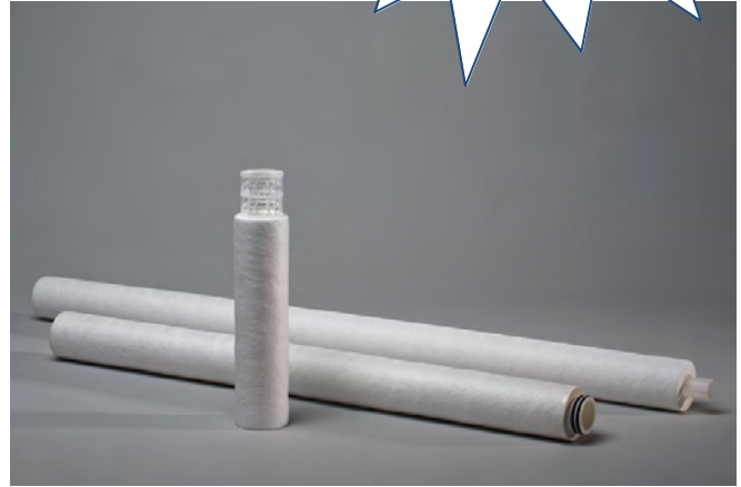
DMB Series melt blown core-less cartridge filters feature an economical and strong self-supporting fiber matrix

DMB Series cartridges are ideal pre-filters and polishing filters where there is a fairly wide contaminant particle size distribution. The depth filtration mechanism also provides excellent control of gelatinous contaminants. A fixed pore structure formed by the non-shedding, bonded medium prevents release of trapped particles. The self-supporting fiber matrix enables a core-less design which is both economical and strong. The polypropylene filter medium provides broad chemical compatibility.