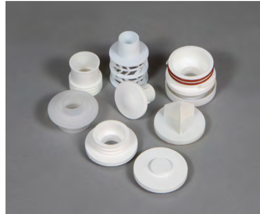
DMB Series core-less filters are available with a variety of end fitting options to fit almost any filter vessel configuration